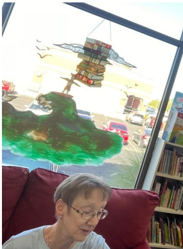
Check out this window behind me. Is it any wonder I love Copper Cat Books!

1570 W Horizon Ridge Pkwy, Suite 170, Henderson