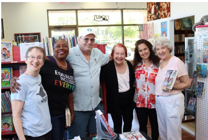
More friends—I felt the love!